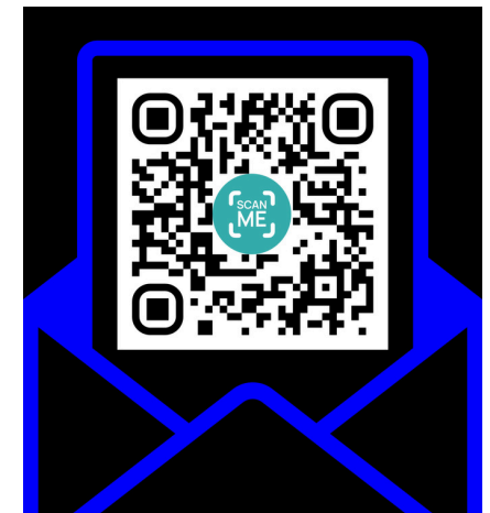
Scan to Register