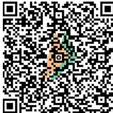
QR code for Payment